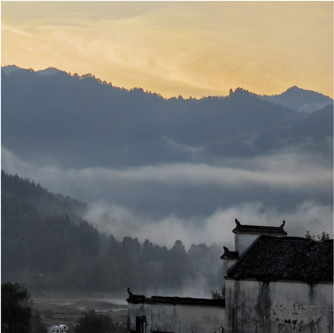
Chaohong Deng, 2024

Key: Yes ✓ No ✗ Mixed ✓/✗ Not applicable -